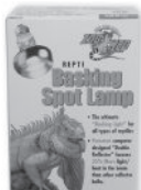
SL-100 REPTI BASKING SPOT LAMP