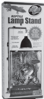
LF-20 REPTILE LAMP STAND