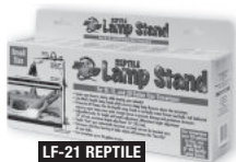
LF-21 REPTILE LAMP STAND