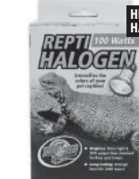
HB-100 REPTI HALOGEN LAMP